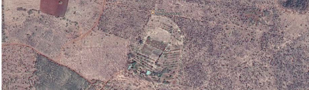
Aranya Farm, Pastapur village, Zaheerabad district, Telangana, plus Bidakanne School Our demonstration and practice school, located at https://goo.gl/maps/reamq7E5qyy

Aranya Farm is 80 kms (3 hrs travel) from Hyderabad, and about 8kms to the nearest town. Participants usually arrive by cab (taxi), bus or train.